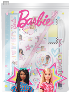
Super Stationery Set BBGL6073 Contains A5 exercise book, pen, pencil, 15cm ruler, sharpener, eraser and sticker sheet in a reusable zip-lock wallet Pack Size 6/48