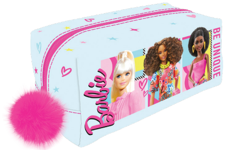
Pencil Case BBGL6075 PU pencil case with pom pom dangler Pack Size 6/72