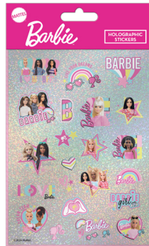
Holographic Stickers BBGL6074 Stickers with holographic background Pack Size 12/192