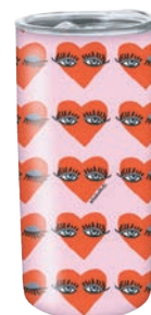
Travel Mug BABH5672

Folding compact mirror with clasp Approx. Size in cm: 7H x 7W Pack Size 6/72