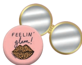
Compact Mirror BABH5669

Wash bag with red zip Approx. Size in cm: 15H x 24W x 6.5D Pack Size 4/24