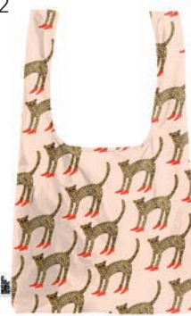
Foldaway Bag BABH5678

Metal water bottle with strap handle Holds 500ml Pack Size 4/48