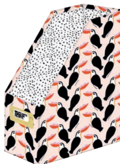
Magazine File BABH5663

A5 notepad with 52 sheets Pack Size 6/24