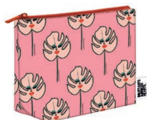
Wash Bag BABH5667

Pencil case with gold zip and woven label Approx. Size in cm: 7.5H x 19W x 8.5D Pack Size 6/72