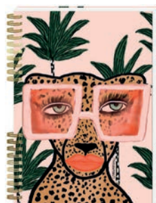
A5 Notebook BABH5660

A4 split wi-ro notebook with lined pages Pack Size 4/24