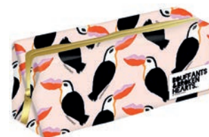
Pencil Case BABH5666

Set of 4 pens packaged in a presentation box Pack Size 6/72