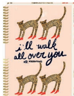
A4 Notebook BABH5659