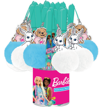
Pom Pom Pens BARB5714

2 pencils each with an eraser topper in different Barbie designs Pack Size 6/72