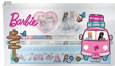
Stationery Set BARB5716

10 colour pen with Barbie M1 topper Pack Size 6/144