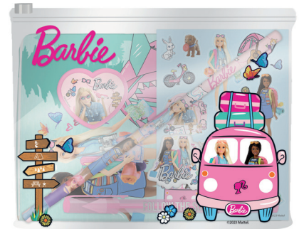
Super Stationery Set BARB5717

Includes 2 pencils, sharpener, eraser and 15cm ruler packaged in a reusable zip lock wallet Pack Size 6/72