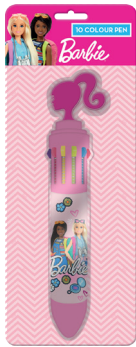
10 Colour Pen BARB5715

Pen with pom pom and character dangler Pack Size 12/144