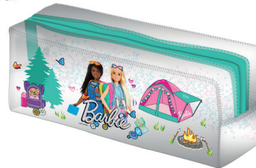
Pencil Case BARB5718

Clear PVC pencil case with Barbie print on either side, and shaker sequin filled front panel Approx. Size in cm: 8H x 19W x 8D Pack Size 6/72