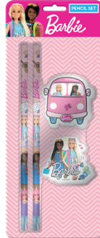
Pencil Set BARB5713

A5 notebook with die cut front cover, die cut pages and lined pages Pack Size 6/36