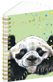
A5 Notebook SNOW5680

Wiro bound A4 hardback notebook with gold foil on cover and lined pages Pack Size 4/24