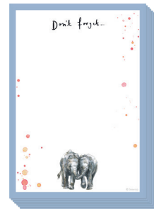
Desk Pad SNOW5681

Wiro bound A5 hardback notebook with gold foil on cover and lined pages Pack Size 4/36