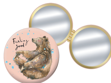
Compact Mirror SNOW5690

Folding compact mirror with clasp Approx. Size in cm: 7H x 7W Pack Size 6/72