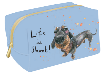
Pencil Case SNOW5684

Pencil case with gold zip Approx. Size in cm: 8H x 19W x 6D Pack Size 6/72