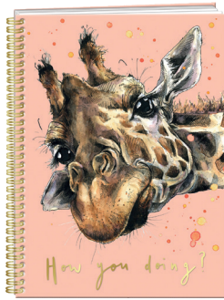
A4 Notebook SNOW5679

Established in 2016 by designer Susy Snow and illustrator Gracie Tapner, Snowtap is a collaborative design studio that creates playful and humorous illustrations for cards, prints, stationery, gifts and homeware. Snowtap specialise in watercolour & gouache, line drawing, printmaking and collage and create whimsical illustrations inspired by the extraordinary natural world, and that is exactly what our stationery and giftware range focuses on!