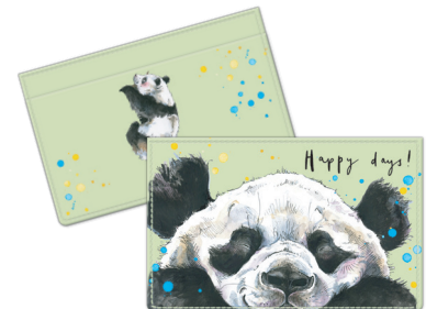
Card Holder SNOW5688

Metal water bottle with strap handle Holds 500ml Pack Size 4/24