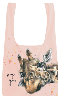
Foldaway Bag SNOW5689

Textured fabric purse with main section and additional pocket Approx. Size in cm: 7.5H x 10W Pack Size 4/60