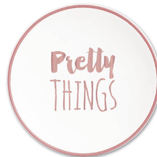
Nik Nak Plate SNSG1742

Ceramic plate to keep rings and things. Dimensions: 8.5cm Dia Pack Size 6/48