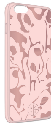
Phone Case SNSG1736

Clip on case for an iPhone 7 Pack Size 4/36