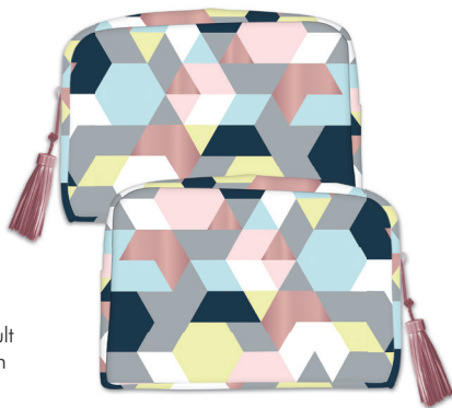
Cosmetic Bag SNSG1731