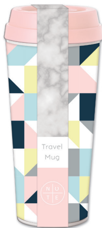
Travel Mug SNSG1738

Clip on case for an iPhone 7 Pack Size 4/36